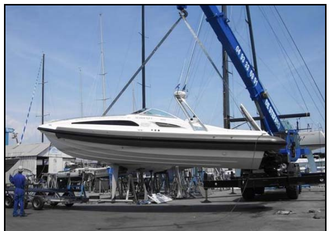
Another Scorpion is craned ashore