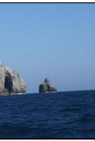
the most westerly point