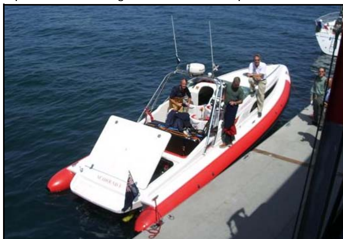
Seahound V refuelling at St Peter Port, Guernsey

The two 320hp Yanmar inboard diesel engines were Replaced, as the originals had clocked up over 800 hours