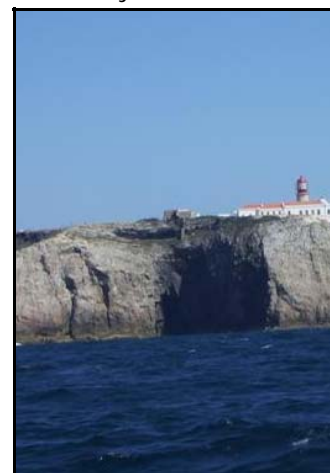
Cape St Vincent, Europe