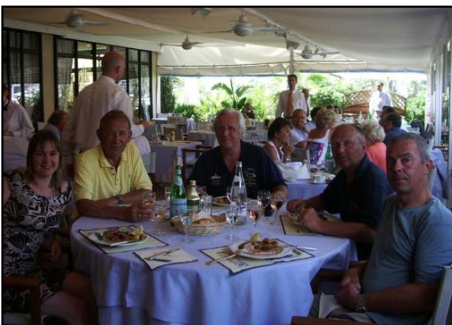
The team indulges in a celebratory meal in Monte Carlo

The last leg of the journey was beautifully calm, and it needed to be, although psychologically it was the worst part of the journey as we all hoped the battery would hold out. I took the helm for the last 100 miles of our record-breaking attempt and had to deal with a force 5 coming at us off the starboard bow which, being typical